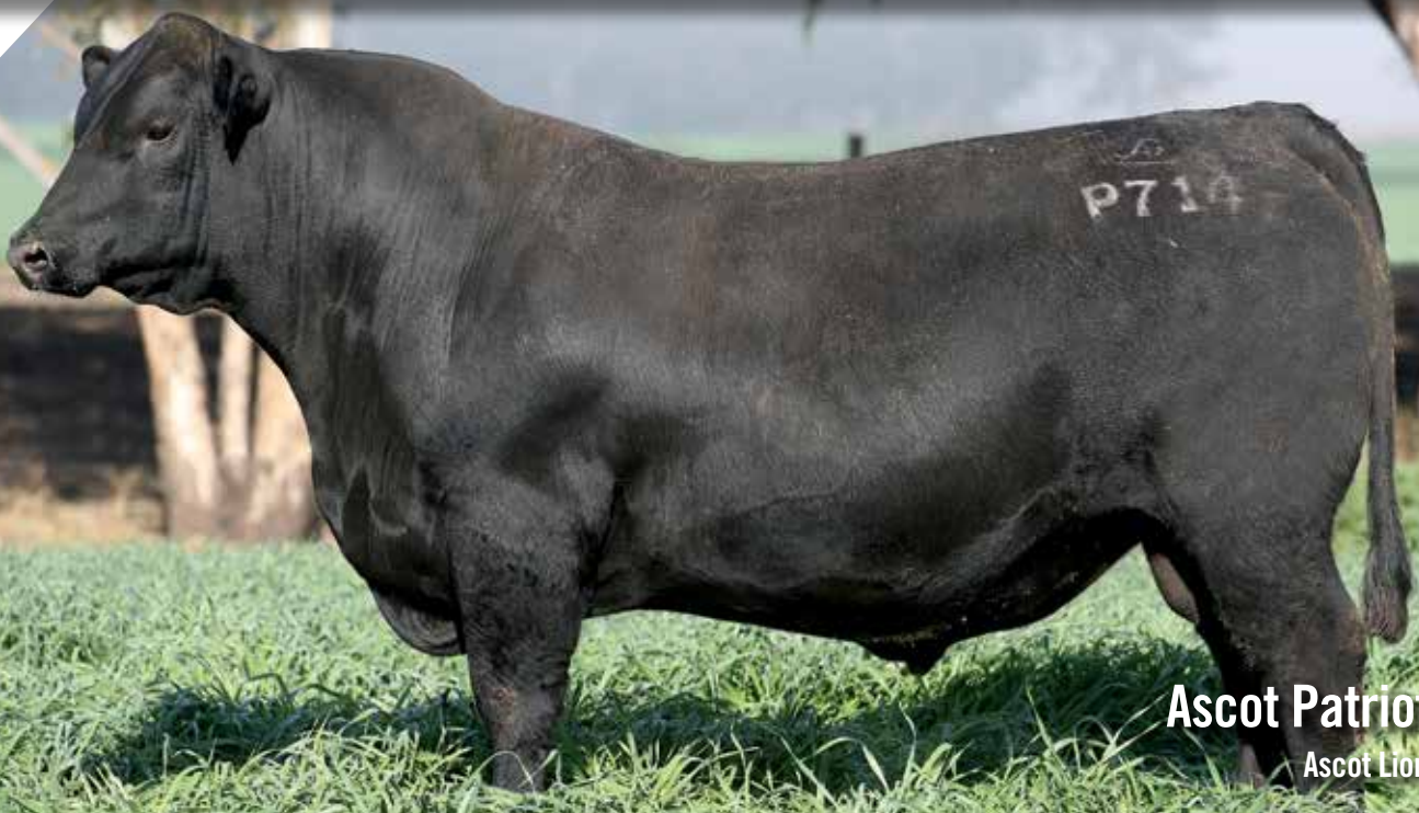
Ascot Patriot P714 Ascot Lionheart Son

40 BULLS SUITABLE FOR HEIFERS | FREE DELIVERY to many major centres