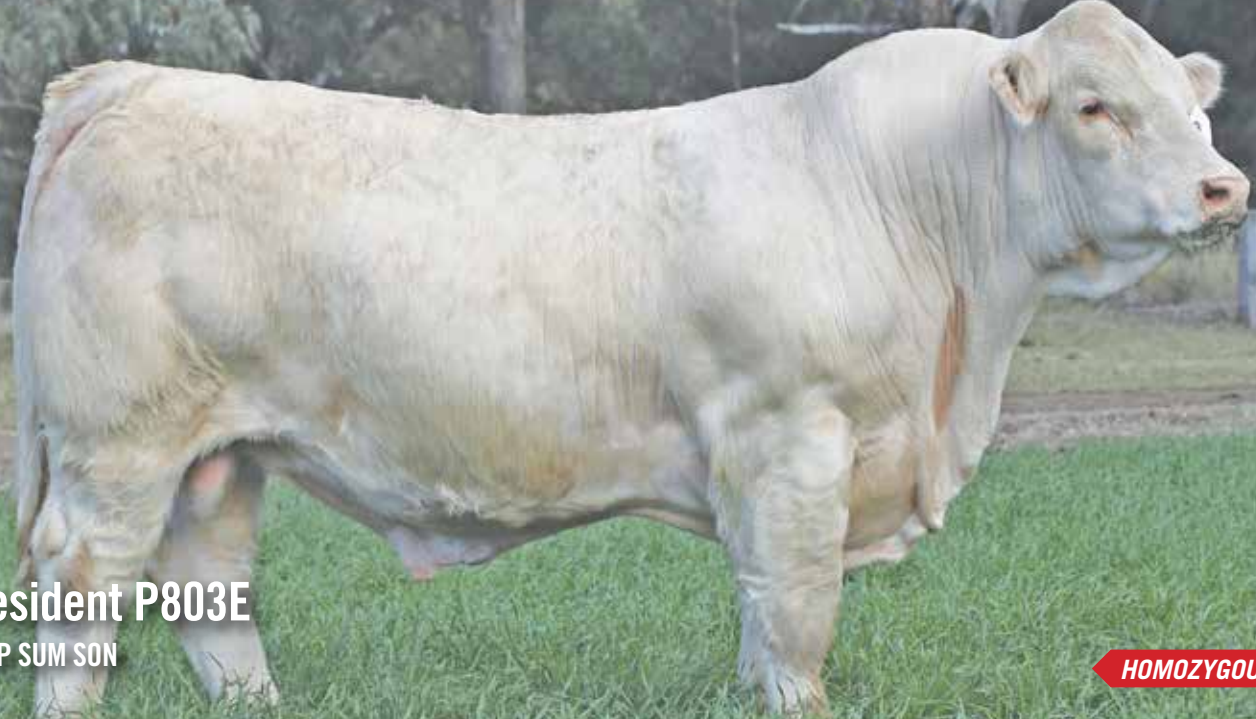
Ascot President P803E ROSEDALE LUMP SUM SON